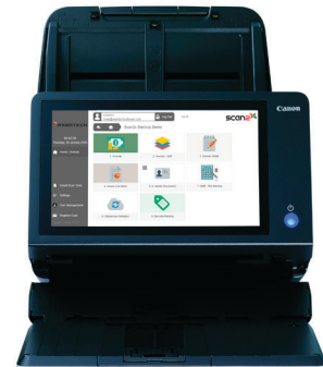
Scan2x on Canon ScanFront