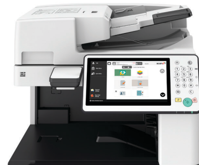
Scan2x on Canon imageRUNNER